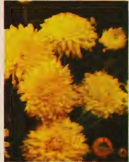
DELIGHT. 60c each; 3 for $1.50